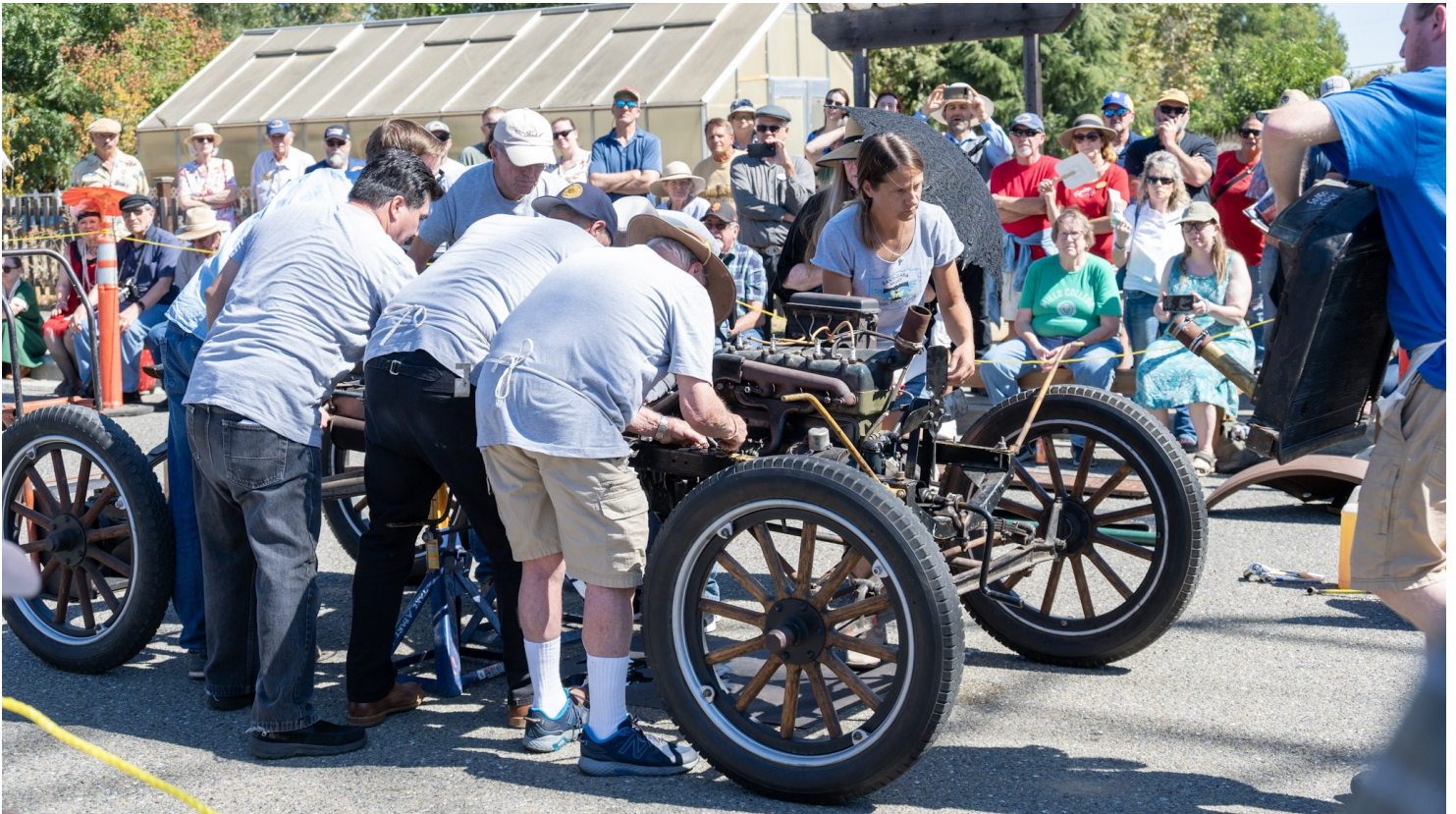
The Put-Together Model T was very popular at the Cars in The Park event.