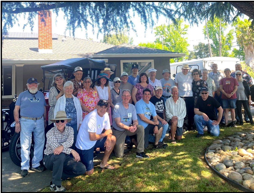
MAY POTLUCK ATTENDEES—STORY PAGE 8

The SCVMTFC is a chapter of the Model T Ford Club of America. The club was founded in 1969 to promote the history and the enjoyment of Henry Ford's Famous Model T.