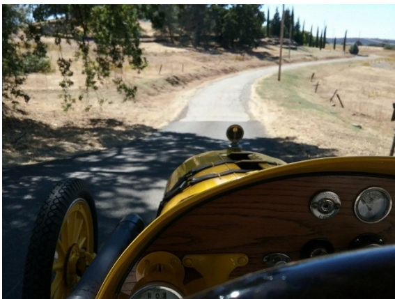
An obscure part of the Lincoln Highway enroute