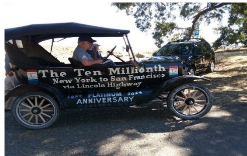
The "Token" 10 millionth