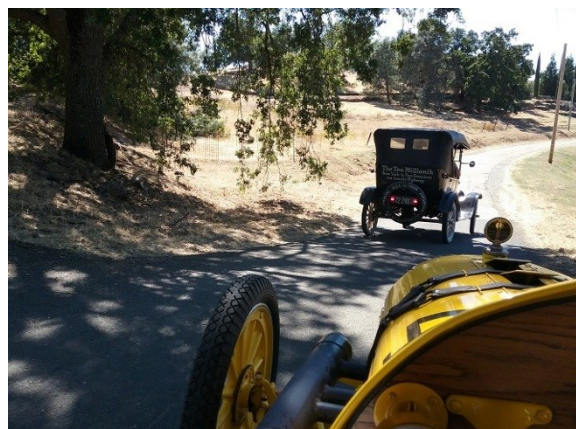
Falling in behind our leader