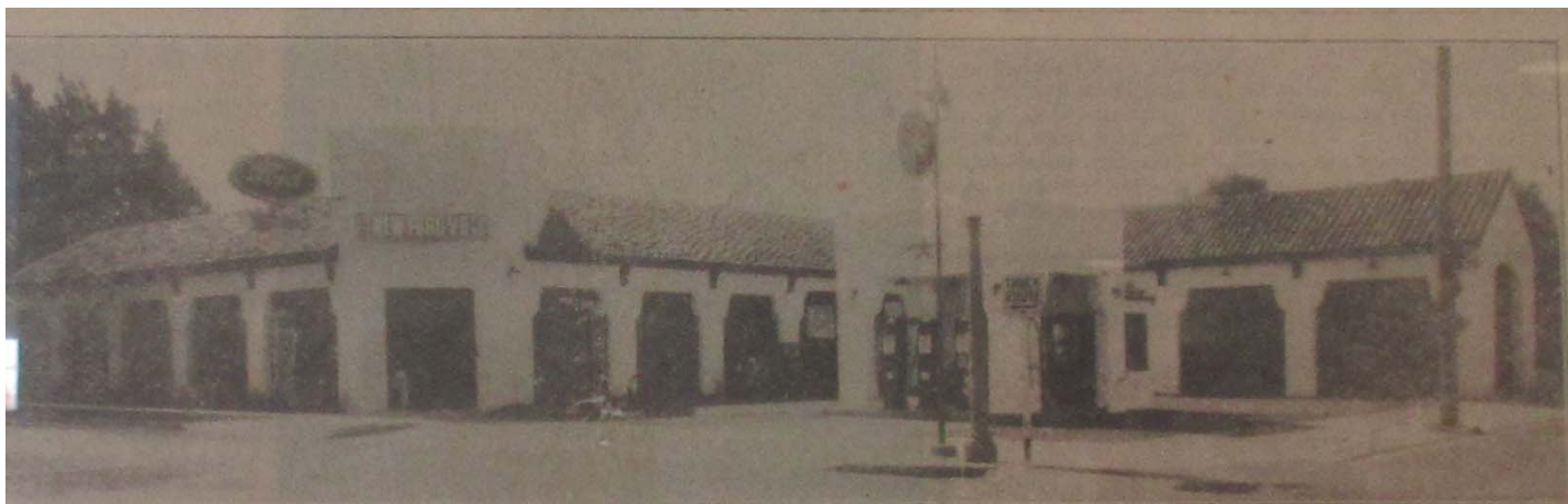
new Tiffany Motor Company building, which will be formally opened tomorrow. The structure, representing an investment of some $35,000, is of reinforced concrete. Its total length is 100 feet, the main body of the structure being 83 by 100 feet, with the wing 24 by 67 feet. The lot occupied by the super-service station is 67 by 78 feet. At the left, invisible in the picture, is the 50 by 50 used car lot, a 22 1/2 foot driveway, and annex buildings housing the used car department, the painting department and the car washing department.

Many of you should, it looks like this now and has great chicken.